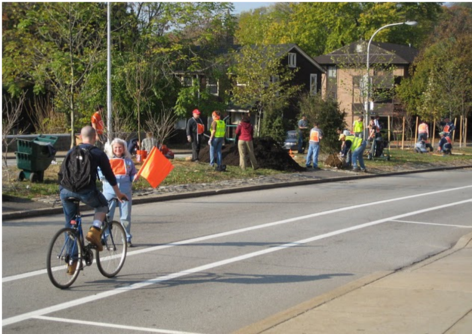
One hundred fifty volunteers plant trees while a cyclist takes advantage of the new bike lane in early November 2008.

By partnering with residents, the City of Pittsburgh and nonprofit organizations Bike Pittsburgh , Tree Pittsburgh and TreeVitalize , East Liberty Development, Inc. improved East Liberty Boulevard, a main neighborhood artery, making it safer and more beautiful in the process.